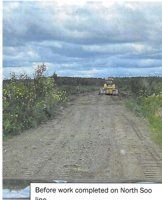
Before work completed on North Soo line