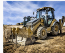
HEAVY-DUTY DIESEL EQUIPMENT