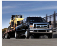
CAR & TRUCK